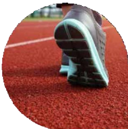
Excellent Balance Between Friction and Sliding