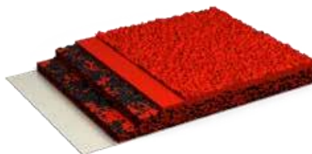
Force Reduction level