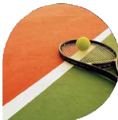
Perfect Ball Bounce