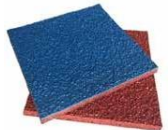
Environmental friendly and sustainable material