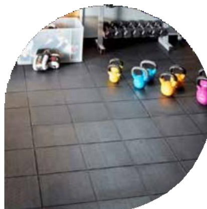
Shock Absorbing Qualities